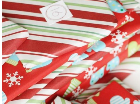
Christmas Competition Coming Soon...

This week, Year 1 have read "Knuffle Bunny" this week, about a child that loses their favourite toy. We brought in our soft toys and we are preparing to write our own lost toy story.