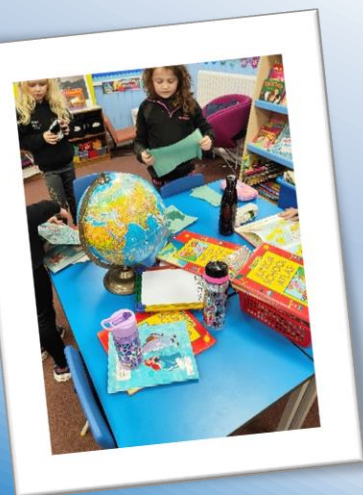
The children in Year 2 have been reading dictionaries and atlases

This week, Year 6 have continued to use the Harry Potter series to help them revise. They have tried to identify different genres of writing using QUIDDITCH THROUGH THE AGES and they identified lots of ways that J.K.Rowling added detail to her writing through complex sentences and adverbials.